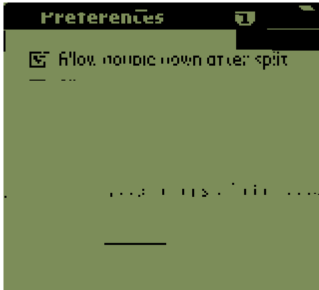
Figure 7: Blackjack Mentor preferences

To change the options for Blackjack Mentor